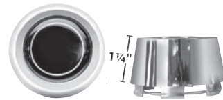
CAPT-1 1/4" tall cap included with 15" wheels