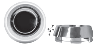
CAPS- 3/4" tall cap option for 15" wheels